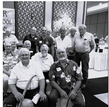
THANK YOU VETERANS

If you would like to make a suggestion for the next Alumni of the year, please bring your suggestion to the Alumni Banquet, along with a paragraph explaining why you are nominating this individual. If you will not be attending the banquet, please mail your suggestion to: